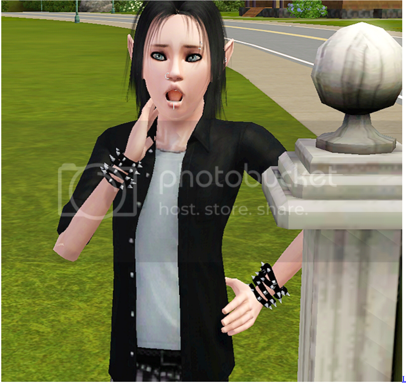
Hard feat K.T. - Ying Yang Twins